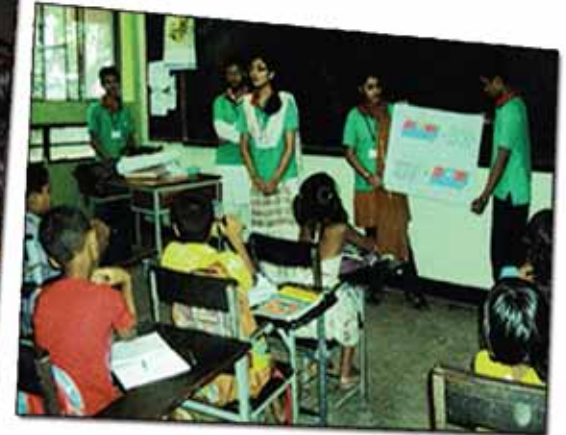
MOMENTS FROM BBLT JUNIOR